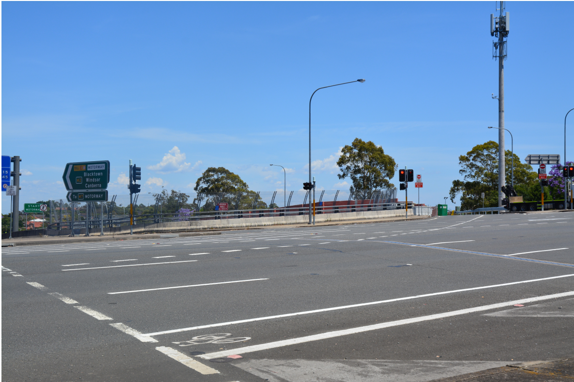
Figure 11: View of overpass.