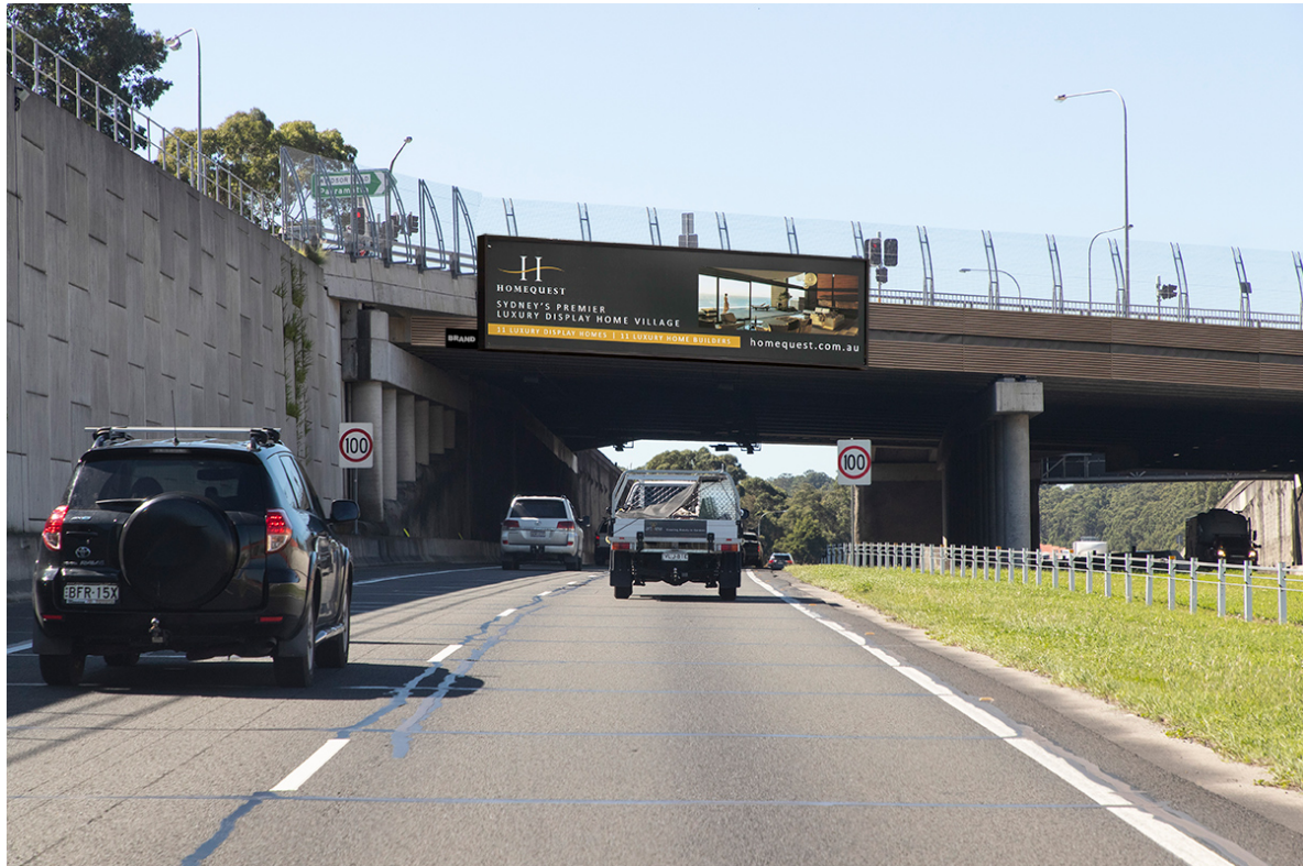
Figure 16: Indicative sign design and proportions in relation to the overpass. Note that the sign is in line with the screening on the eastern façade and below the handrail. Views from the overpass and nearby heritage items will not be impacted by its construction.