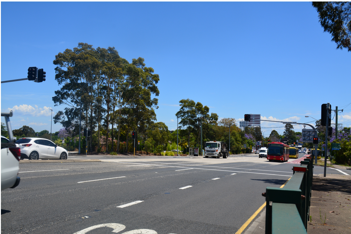
Figure 12: View north-west along the heritage listed portion of Windsor Road from overpass.