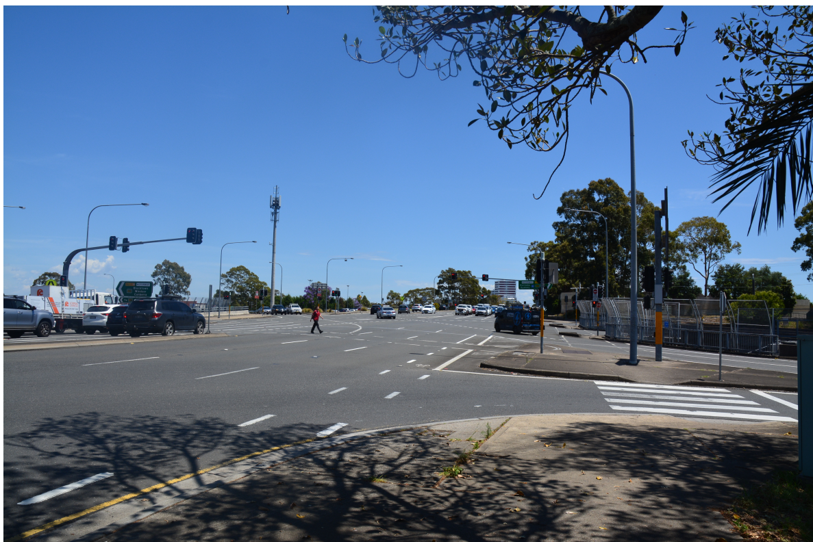
Figure 8: Approach to the overpass from south eastern (Parramatta) side.