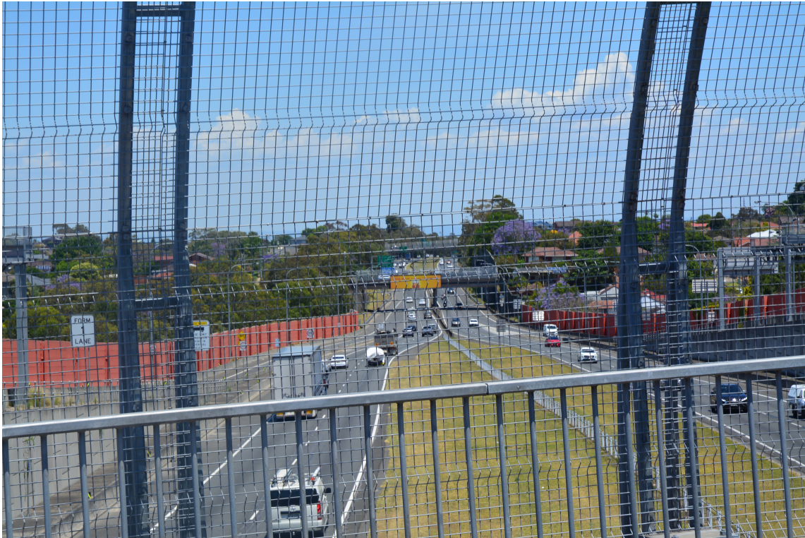
Figure 15: View west from the overpass. The sign will be hung on the right and will be below the height of the barrier walls. See figures 7, 14 and 16.