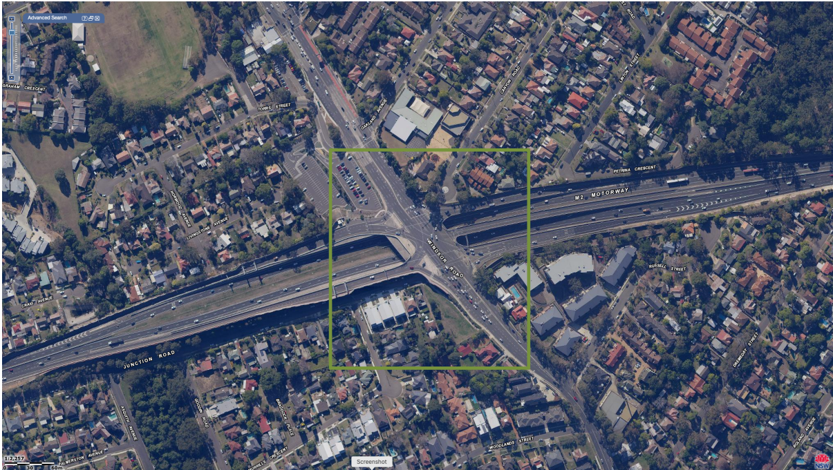
Figure 2: The Windsor Road M2 overpass and environs is located within a commercial and residential area, views to and from the M2 are screened by barriers.