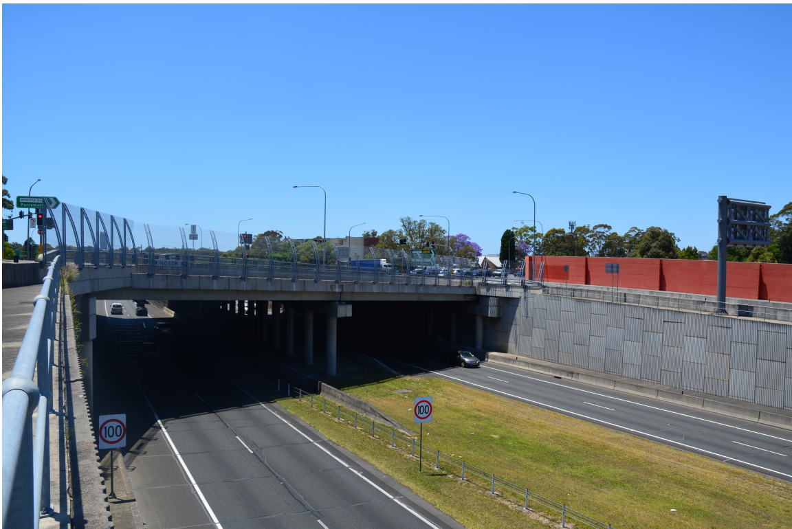
Figure 14: View east from side of the off ramp showing the proposed location of the sign and the extent of barriers that will shield the sign from the view of heritage items - the farm cottage and former Baulkham Hills school on the right and Windsor Road on the left.