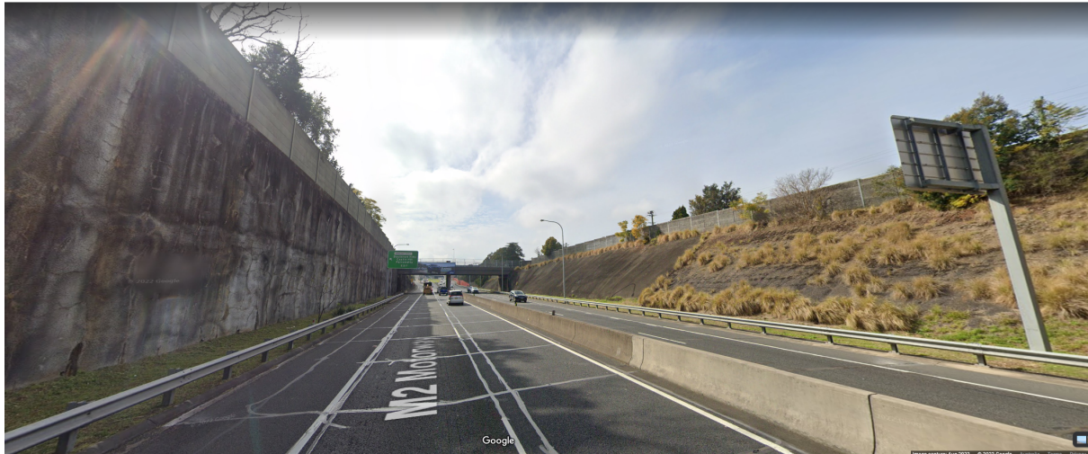
Figure 5: View east toward Vincent Street overpass, showing the depth of the road cutting.