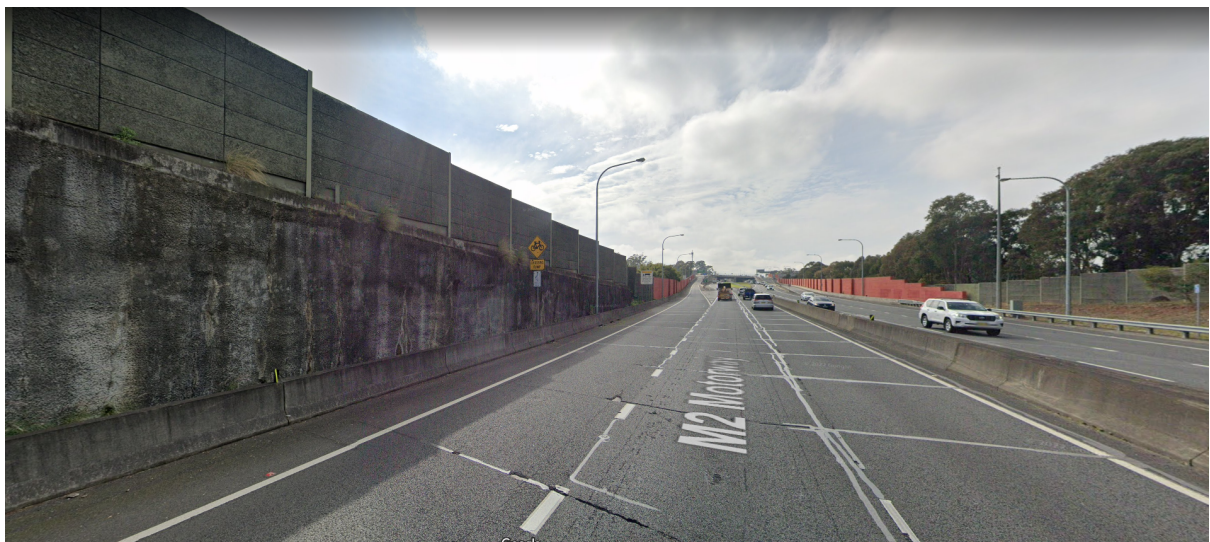
Figure 6: View east toward Windsor Road turn off overpass.