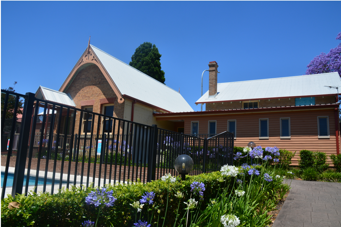
Figure 9: View of the rear of the Former Baulkham Hills Public School, now incorporated into a housing complex.