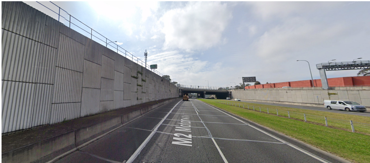
Figure 7: The sign will be attached to the overpass. There can be no impact of heritage items in the vicinity due to barriers.