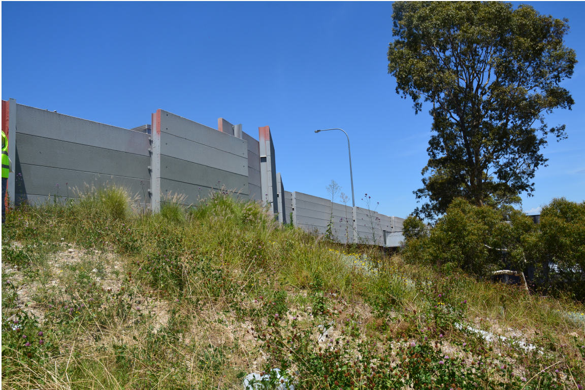
Figure 13: View of walls adjacent to proposed site of signage.