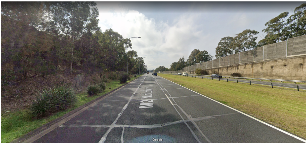
Figure 4: View east from M2 near Cropley Drive Overpass.

The M2 motorway east bound through Baulkham Hill Beecroft (northern side) and Northmead (southern side) is fringed by sound barriers and for the most part is cut into the topography. Figures 4 – 7.