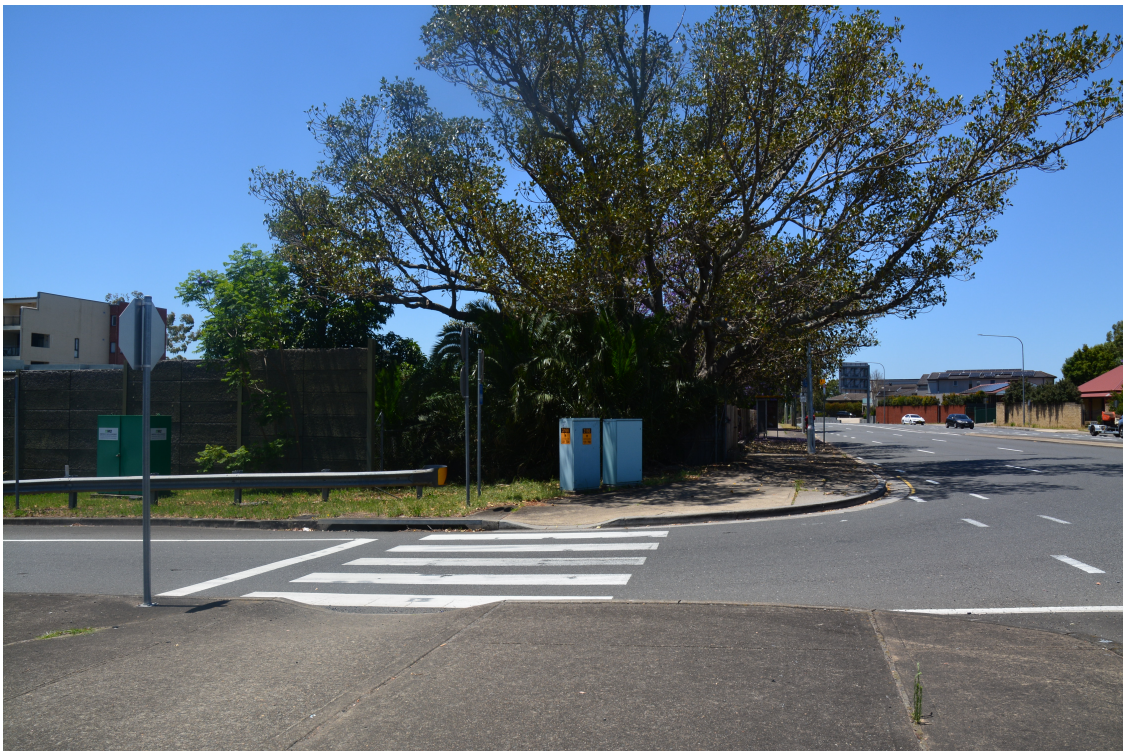
Figure 10: View of the heavily screened former Baulkham Hills Public School from the M2 overpass.